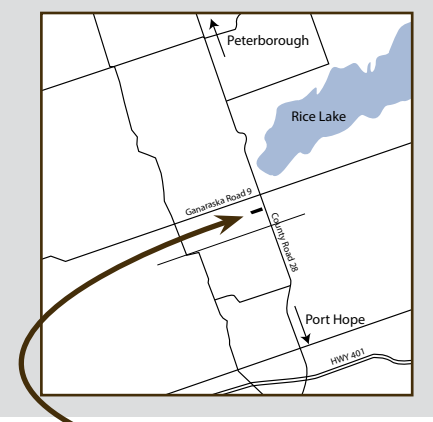
Cedar Hedge Farm 7612 County Rd 28, Campbellcroft, Ontario, LOA 1B0 www.cedarhedgefarm.ca

Follow us on FaceBook and instagram to keep up with all that's happening on the farm.